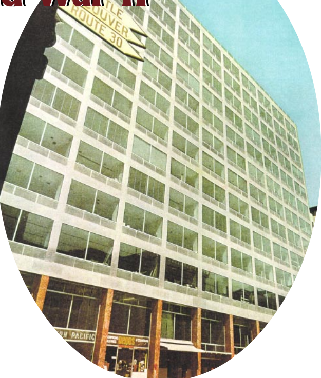
Front elevation of the Equitable Building in Portland, Ore.<sup>8</sup> The building is considered to be the prototype for the modern fully airconditioned building.

In the absence of new projects during the war moratorium on civilian buildings, one of the leading architectural magazines, Architectural Forum , ran a special issue on post-war trends.<sup>5</sup> The editor, Howard Myers, invited a number of leading architects including Louis Kahn, William Lescaze, Mies van der Rohe and a lesser known Italian architect from Portland, Ore., Pietro Belluschi, to produce designs for a range of projects that might be built in a medium sized town after wartime building restrictions were lifted. Myers stipulated that the architects' design "show an advanced but not stratospheric" approach to planning construction and equipment and that they