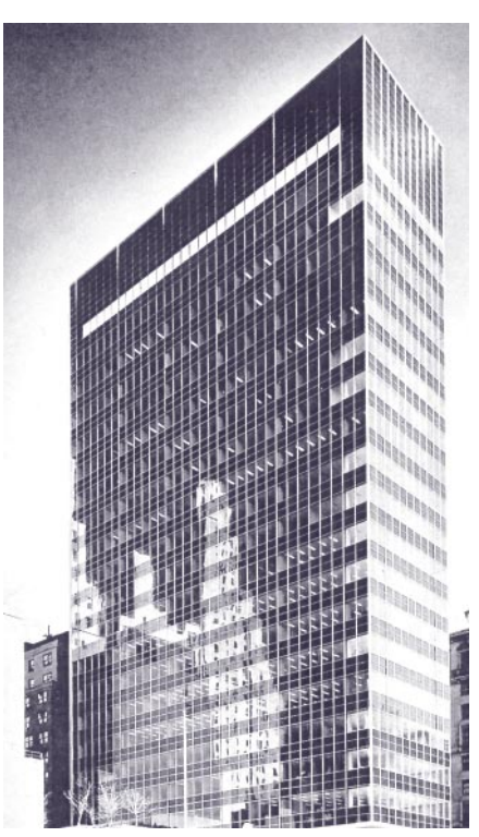
Figure 3: Lever House, 1952.<sup>16</sup>

Similar principles were adopted for the design of Lever House,<sup>15</sup> completed in 1952, two years after the U.N. Building. Unlike the U.N. building, it is totally curtain walled on all four sides and was one of the first to have sealed windows and