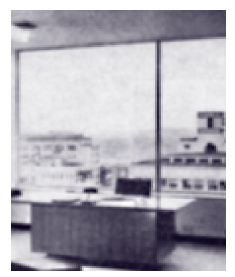
Figure 2: Interior view of a typical office in the Equitable Building.<sup>9</sup>

Carrier recognized the problem in the 1920s and decided that high velocity air was the answer.<sup>12</sup> He did not pursue it at