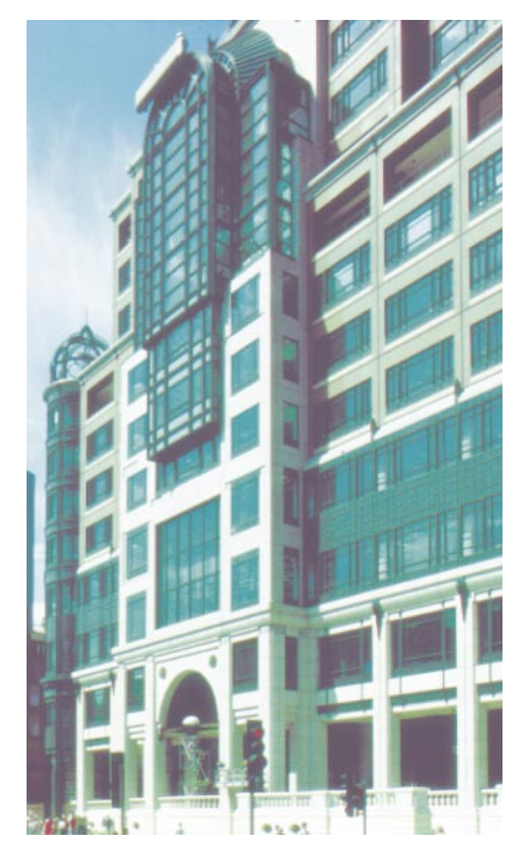
Figure 4: Broadgate development, London.

• The airflow rate varies with the rate of cooling therefore, if less airflow is required less energy is necessary for delivery.